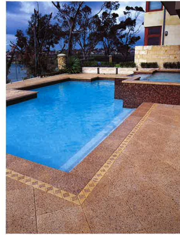
Left | Spinafex bush hammered pavers highlighted by Spinafex polished Setstone borders and machined half-round pool coping.