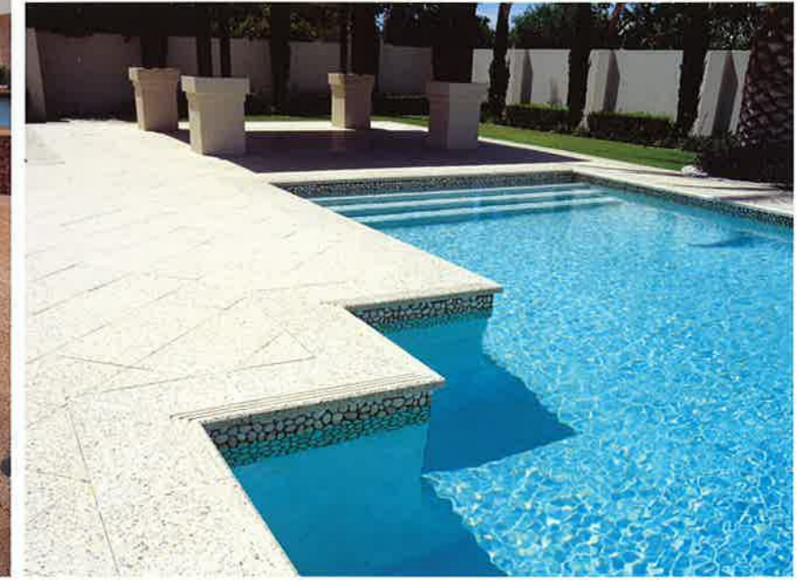
below | Saltbush bush hammered pavers complemented by Saltbush machined triple groove pool coping.

This brochure is designed to provide you with a general understanding of the importance of installing your UrbanStone in the correct manner as described in our technical manual. These detailed procedures are available at www.urbanstone.com.au or by calling your local state office. Here are the brief general answers to the most frequently asked installation and maintenance questions regarding UrbanStone residential products.