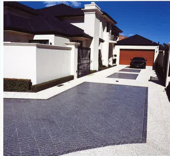
Left | Saltbush bush hammered pavers in conjunction with Saltbush machined pavers and Saltbush bush hammered single bullnoses.