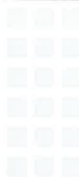
Left & Below | Saltbush bush hammered pavers with Saltbush Cobble borders and machined pool coping.