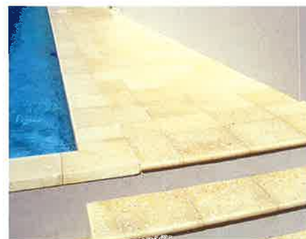
Above | Travertine dimension cut pavers with Travertine single bullnose step treads and half round pool coping.

Western Australia Head Office 27 Jandakot Road Jandakot WA 6164 Tel: (08) 9417 2444 Fax: (08) 9417 7060